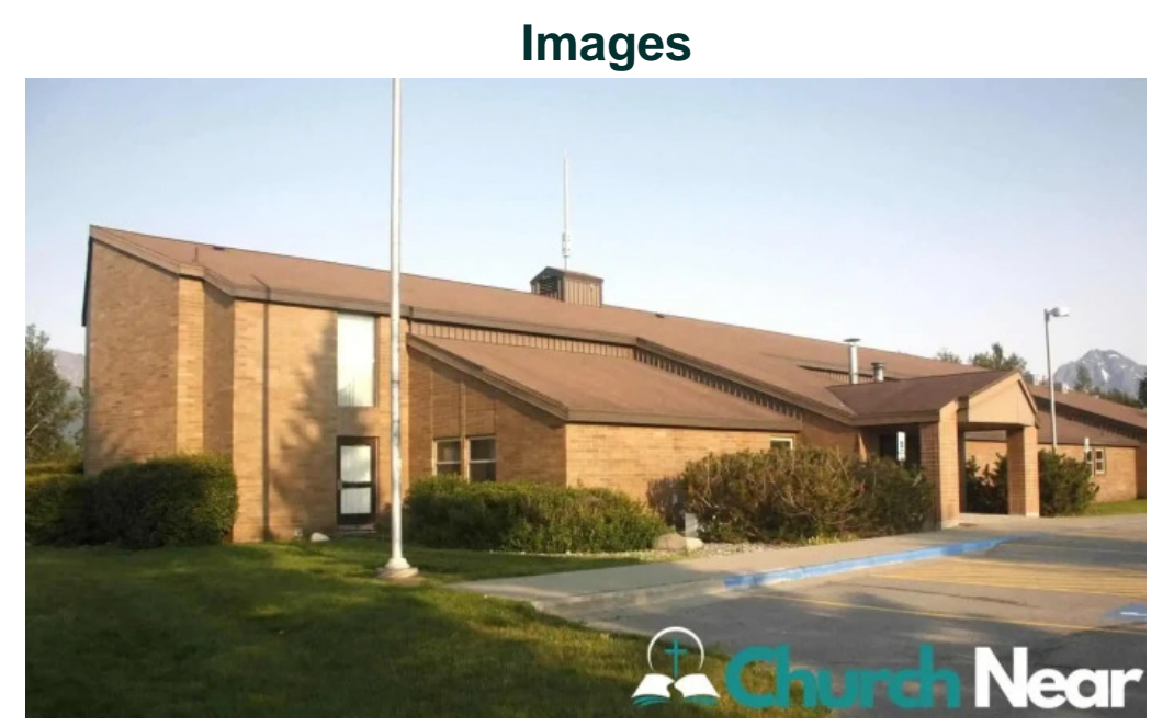
The church of jesus christ of latter day saints palmer

If you require to modify any information that you think is not accurate about this web, we kindly request deliver a message so we can we will correct it at the earliest convenience. With anticipation thanks for your cooperation.