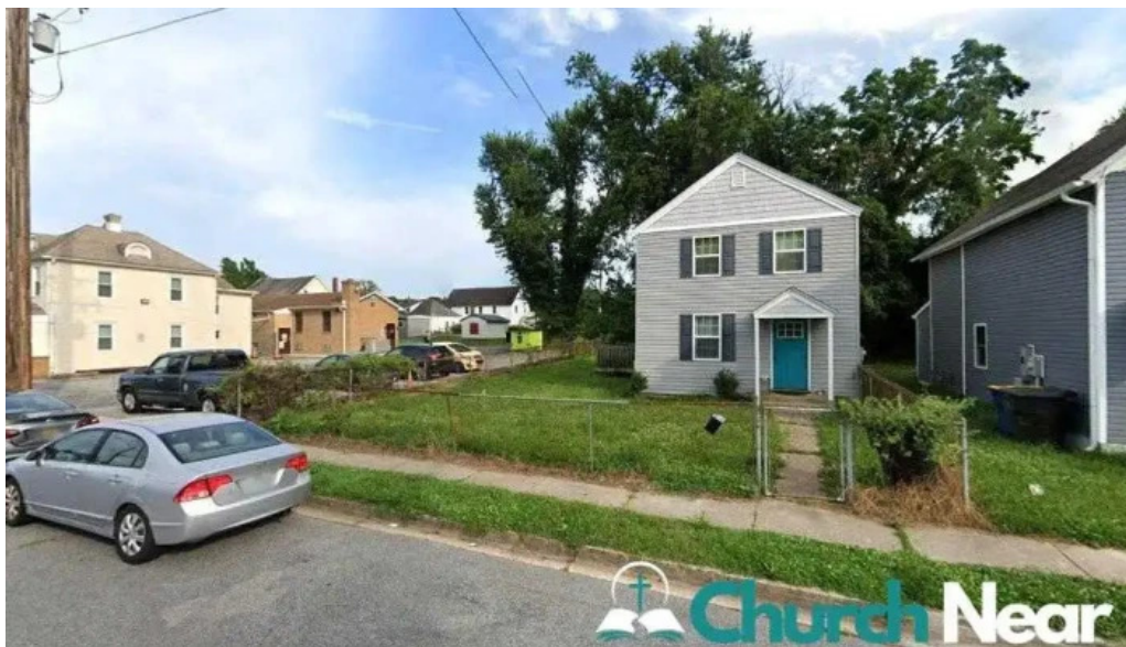
Interdenominational ministerial alliance of dover and vicinity dover