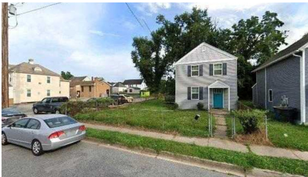
Interdenominational ministerial alliance of dover and vicinity all