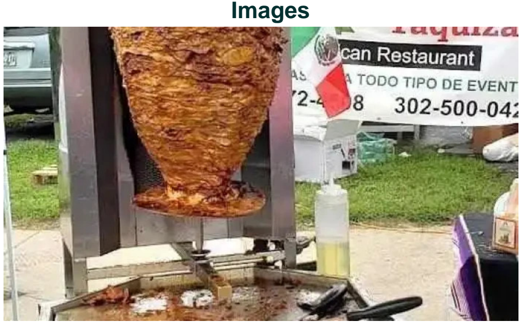
La esperanza community center georgetown

If necessary to alter any element that you consider is not accurate related to this portal, we ask deliver a message so that we will fix it as soon as possible. Thanks beforehand thanks for your cooperation.