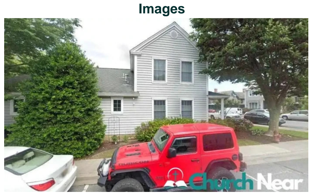
St peter s church parish hall lewes

If you require to alter any data that you believe is not correct related to this portal, we kindly request send us a message and we will adjust it at the earliest convenience. In advance thanks for your cooperation.